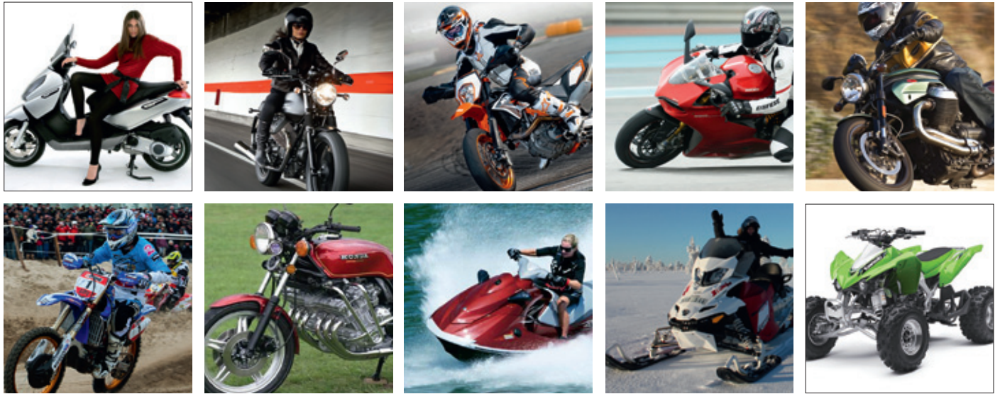
MAIN ADVANTAGES SHIDO LION OVER LEAD - ACID BATTERIES FOR ALL # APPLICATIONS