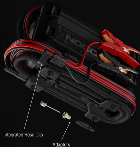
Integrated Hose Clip