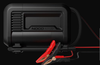
AIR20 Portable Air Compressor w/ 3ft Braided Hose & 20ft Power Cord + Clamps