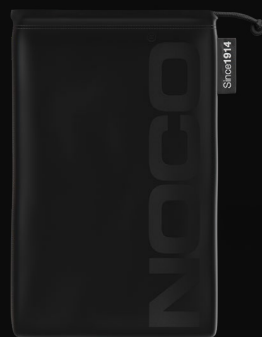
Microfiber Storage Bag

AIR15 Portable Air Compressor w/ 3ft Braided Hose & 10ft Power Cord + 12V Cigarette Lighter Plug